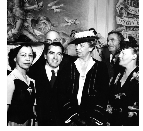
Eleanor Roosevelt at Freedom House