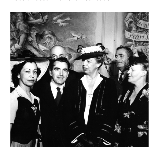
Eleanor Roosevelt at Freedom House