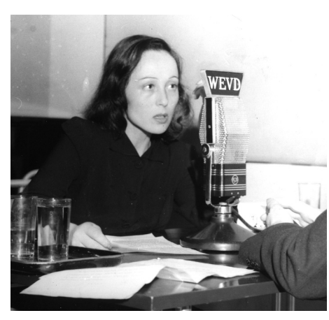
Luise Rainer on WEVD